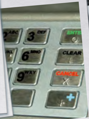
BANKING AND PAYMENT CARD SCAMS