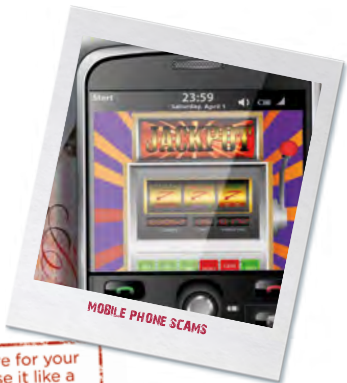
MOBILE PHONE SCAMS